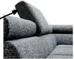
1) THE SOFA HAVE THREE FCUTION KEY