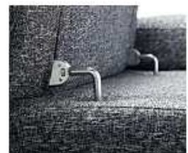
3) RELEASE POTIONS