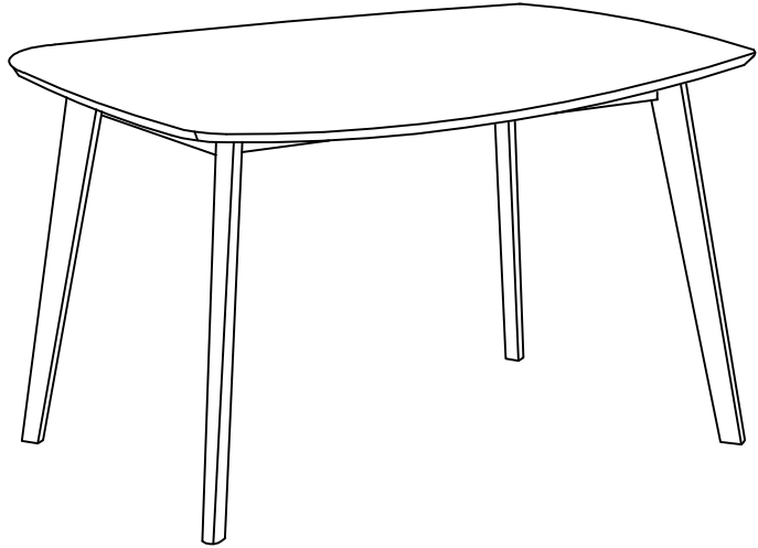
COMPLETED TABLE ASSEMBLY.