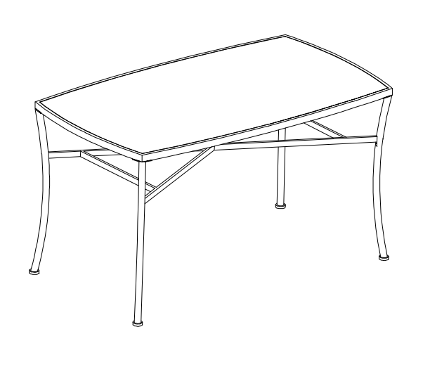
STEP 2 - Finish